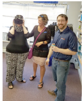
ple while enjoying food and refreshments by Calzolaio Pasta Co.

The Chamber provided information on upcoming events including seminars, Foothills Fest, Seth Wescott & Franklin County Chamber Golf Classic and the Tri-Chamber BBQ. Each attendee had a chance to introduce themselves and their business. Networking time provided a chance to talk to acquaintances and meet new peo-