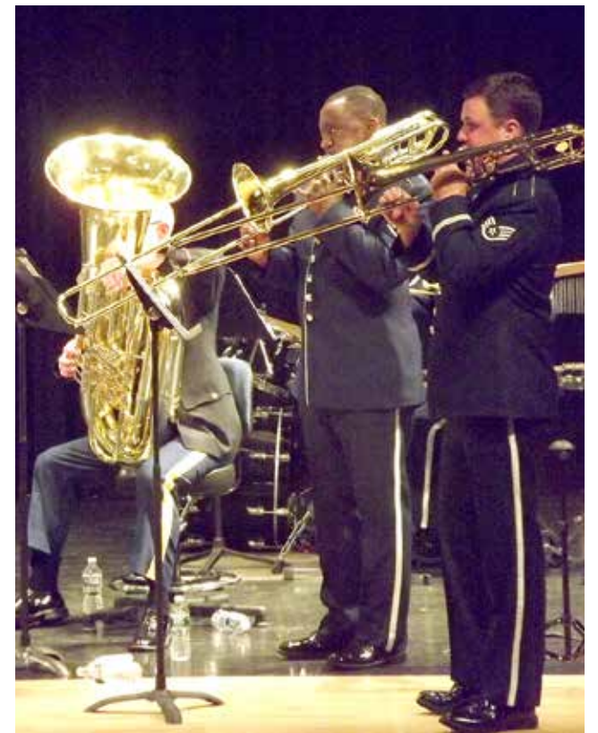
A portion of the USAF Heritage Brass Band performing at Mt. Blue Campus on June 10, sponsored by the Franklin County Chamber of Commerce.